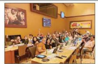
A group of 35 guests celebrating a family reunion at Red Rock and decided to play bingo. They had a blast!