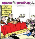
"Flooding right ahead..."