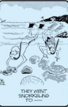
Now arrange the circled letters to form the surprise answer, as suggested by the above cartoon.