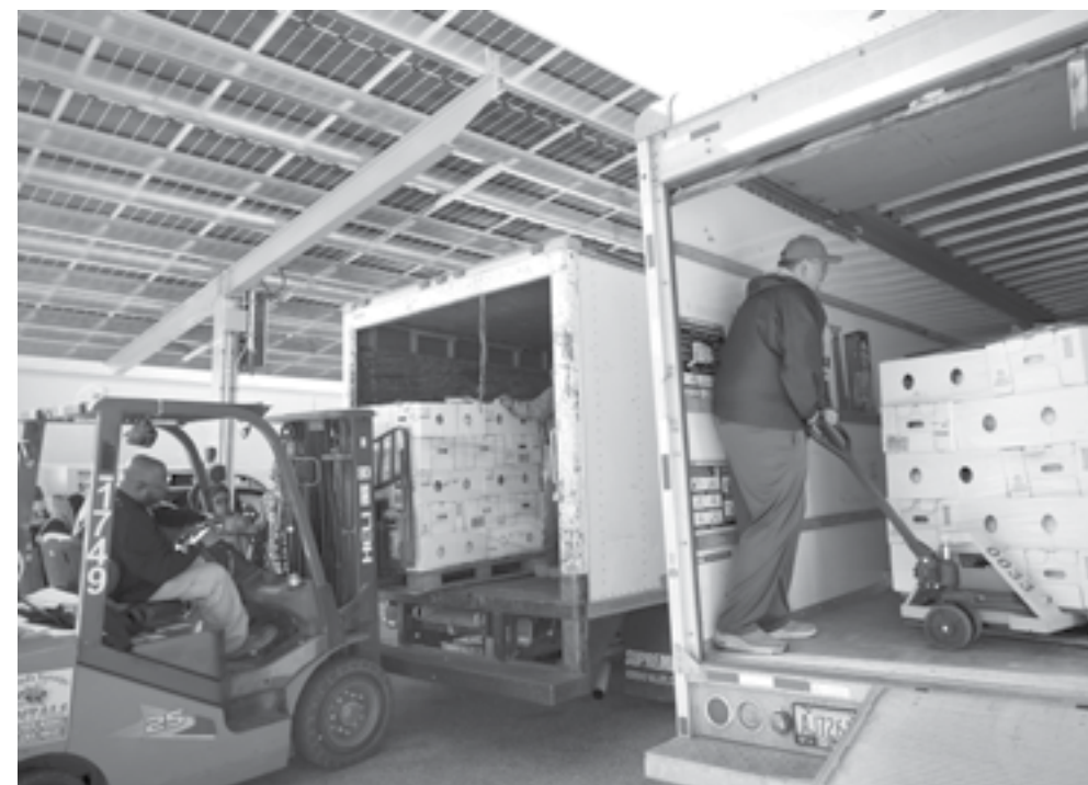
Churches, food pantries and veteran groups were among the 115 organizations that received free turkeys from the Morongo Band of Mission Indians.