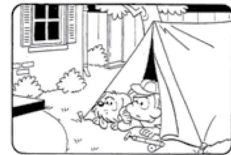
Find at least six differences in details between panels.