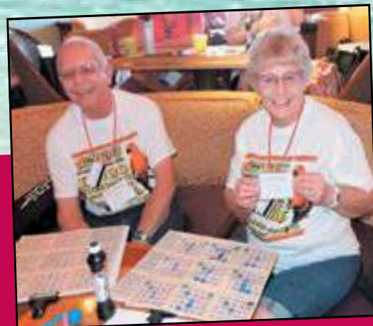
SAILING FROM NEW ORLEANS, LA.

THIRTY FIVE YEARS of experience guarantees that the Bingo Bugle knows just how to bring you the best of Bingo. Our courteous, friendly and experienced staff members offer early-bird Bingo and special games in addition to the World Championship Tournament games.