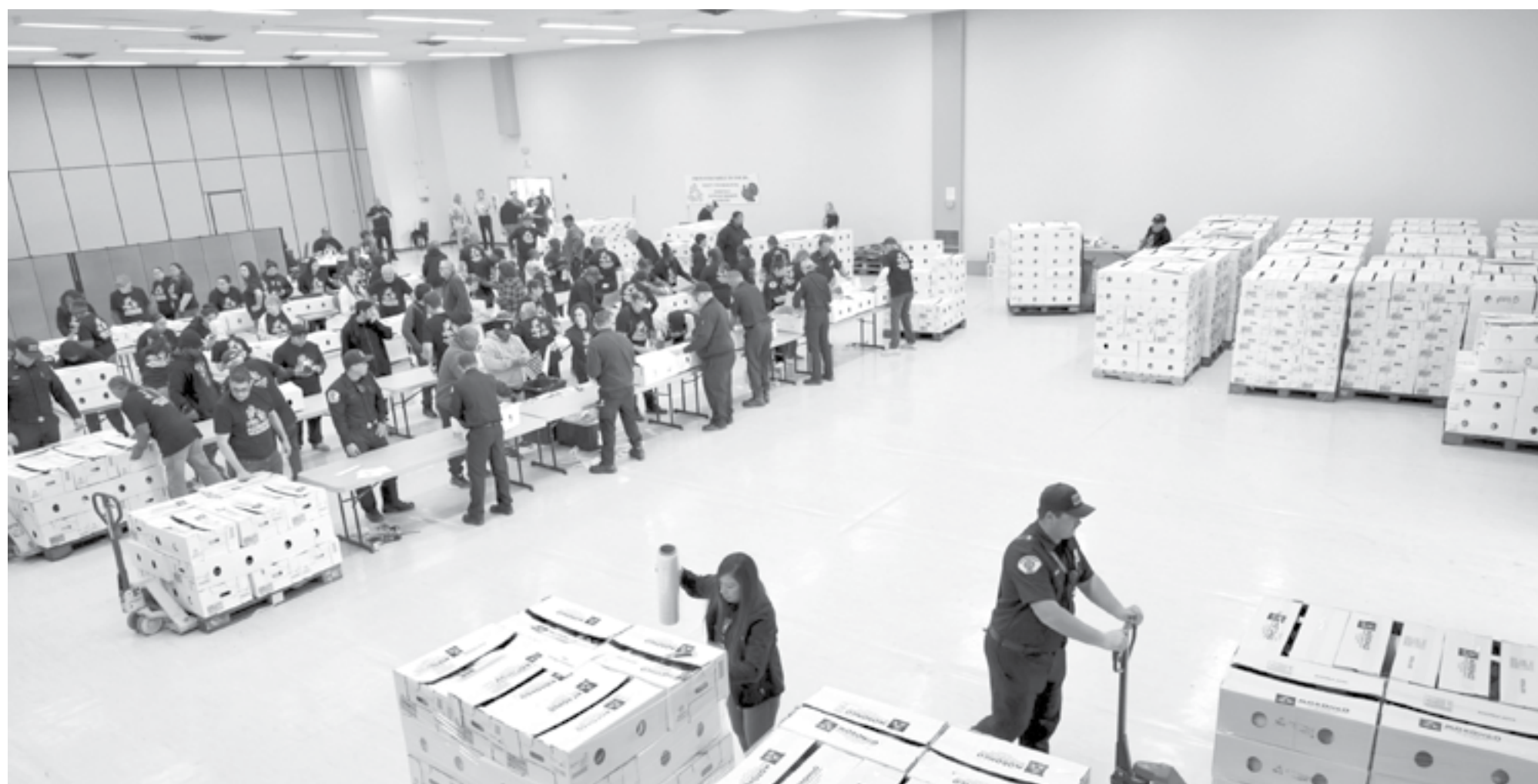
Dozens of volunteers helped distribute 15,000 free turkeys from the Morongo Band of Mission Indians.

© 2023 by King Features Syndicate, Inc. World rights reserved.